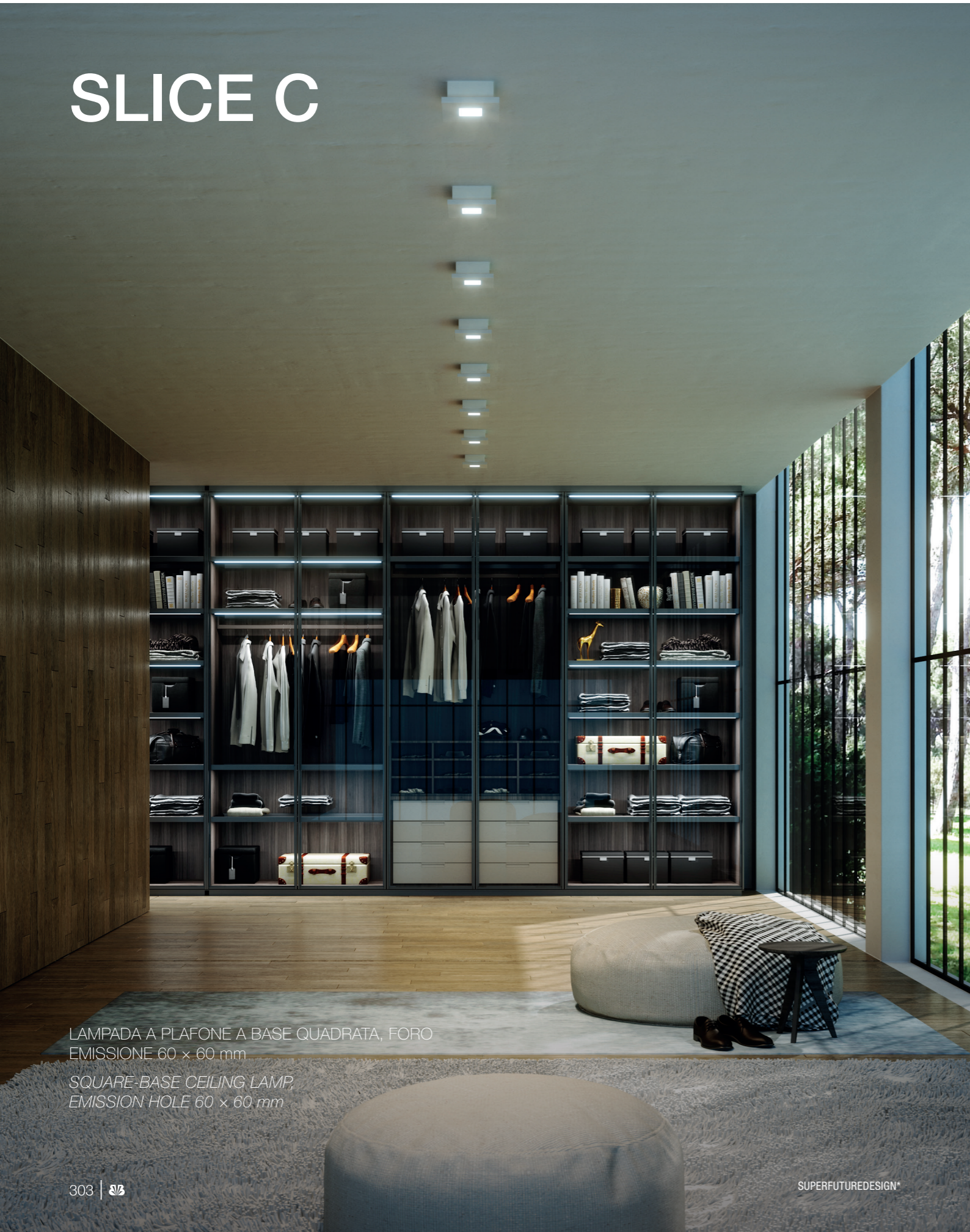
LAMPADA A PLAFONE A BASE QUADRATA, FORO EMISSIONE 60 x 60 mm SQUARE-BASE CEILING LAMP, EMISSION HOLE 60 x 60 mm