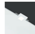
SLICE see page 115

For further info and other available drivers please see page 407