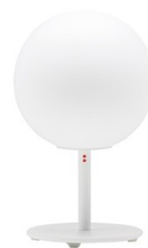
Table lamp with diffuser in satin-finish white blown glass. Supporting structure made of metal or polyester reinforced with glass fibre, painted white.